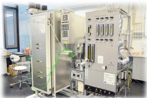
Catalyst testing unit in the Laboratory of air protection